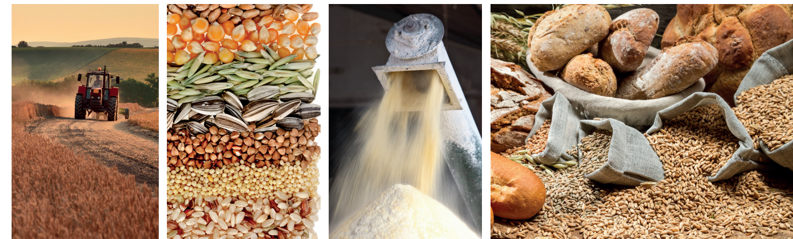
The process cascade from raw material to consumer is often long.